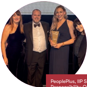
PeoplePlus, IIP Social Responsibility Organisation of the Year Award winners