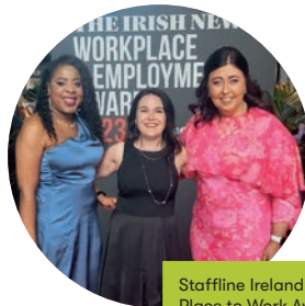
Staffline Ireland, Irish News Best Place to Work Award winners